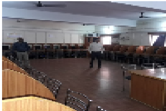
COMPUTER LAB PHOTO